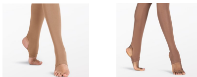
"Honey" or "Hazelnut" STIRRUP tights for all performances (to match skintone). Jazz shoes are available in both colors as well.