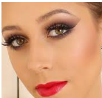
Makeup for 12+