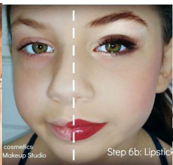
Makeup for 11 & under